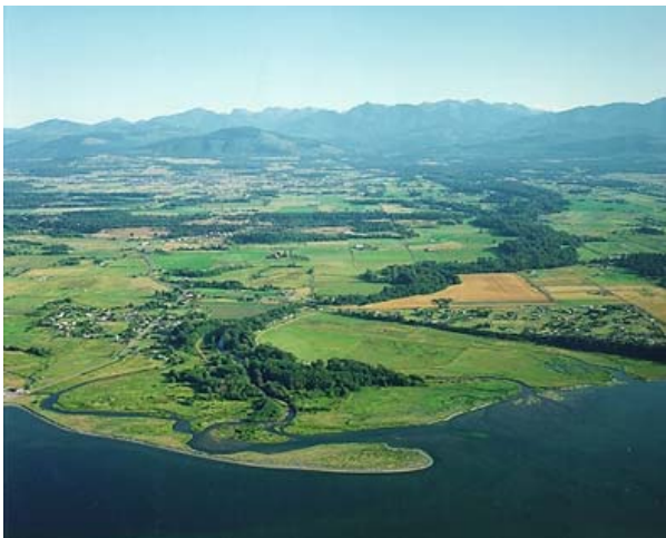
Views of Dungeness River watershed from the mouth upstream into the Olympic Mountains.

The 32-mile long Dungeness River begins high in the Olympic Mountains near Mystery Mountain and flows into Dungeness Bay and the Strait of Juan de Fuca near the City of Sequim, Washington. The National Wildlife Refuge at the river mouth includes the famous 9-km long Dungeness Spit and Lighthouse. The watershed is home to several salmon species. The population of pink salmon is entirely native wild stock with no hatchery influence.