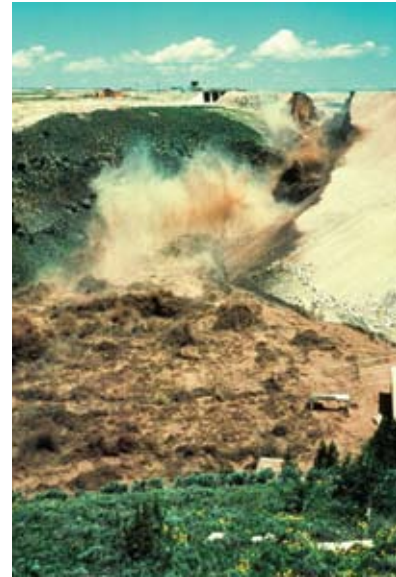
The Teton Dam in southeastern Idaho collapsed on first filling on June 5, 1976, causing the deaths of 11 people and $2 billion in damages.

Within the complexities of many critical infrastructure projects, a clear project champion is sometimes difficult to identify. At a minimum,