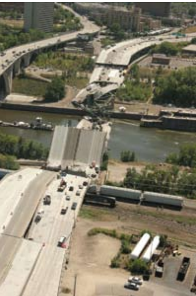
The I-35W Bridge in Minneapolis, Minnesota, collapsed into the Mississippi River and riverbanks on August 1, 2007, killing 13 people and injuring 145.

Given the rapid changes our nation is undergoing, evaluating the sufficiency of existing critical infrastructure is increasingly important. The consequences of failure of critical infrastructure projects built even 20 or 30 years ago may now be significantly different from the consequences