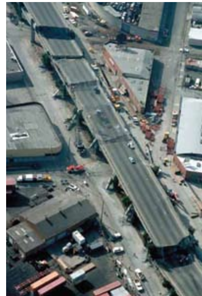
A double-deck freeway in Oakland, California, collapsed during the Loma Prieta earthquake on October 17, 1989, crushing the cars on the lower deck and killing 42 people.

The challenges of implementing a life-cycle, integrated systems approach are well known. Critical infrastructure projects are typically large and complex. Organizations and systems must be in place to ensure that critical infrastructure is properly operated and maintained over time. The following items outline broad-based ways to achieve this.