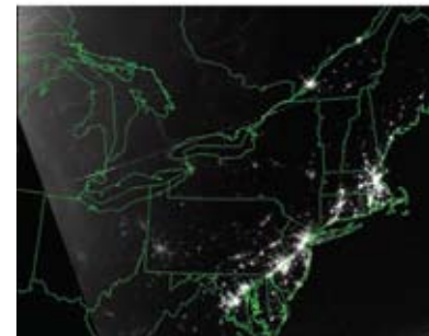
The northeast blackout of August 2003 left 50 million people across eight states and one Canadian province without power, causing a cascading failure of interdependent critical infrastructure systems. (top image – 20 hours before the blackout; bottom – about 7 hours after.)